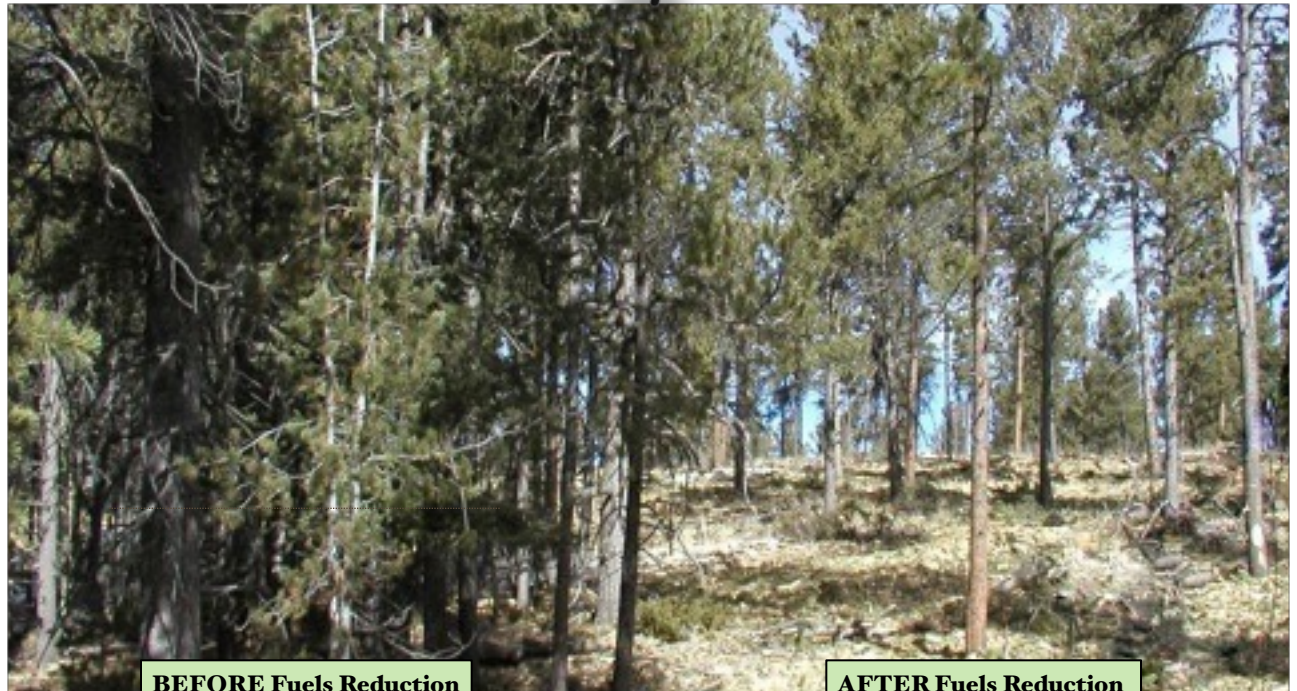
BEFORE Fuels Reduction

Mulch: Free when available (load yourself)